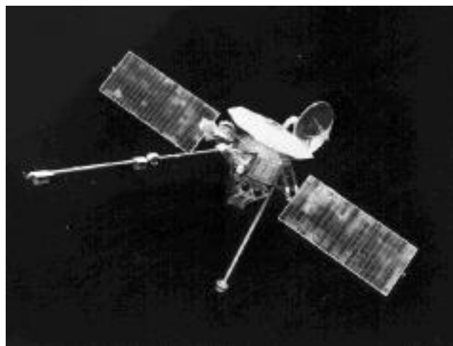
Mariner 10 launched November 4, 1973 was the seventh successful launch in the Mariner series and the first spacecraft to use the gravitational pull of one planet (Venus) to reach another (Mercury).