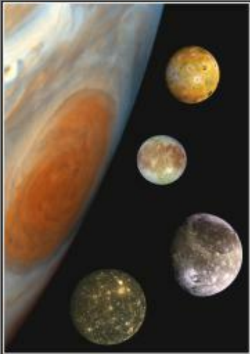
Family Portrait of Jupiter's Great Red Spot and the Galilean Satellites