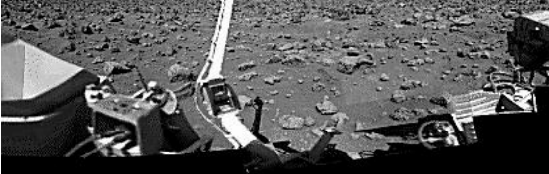
Viking 2 – 9/9/1975 - Mars Orbiter and Lander